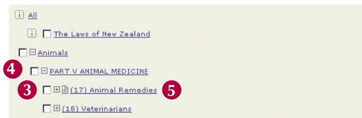
Figure 2: Publication Tree (table of contents)