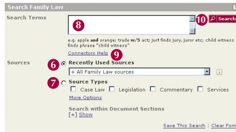
Figure 2: Practice Area Search Form